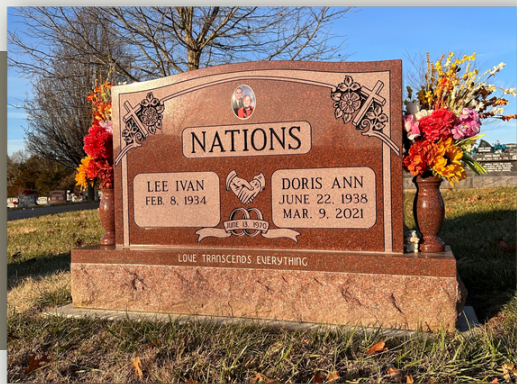
Upright India Red Shepherd Hills