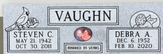
Markers Over 20 granite colors available