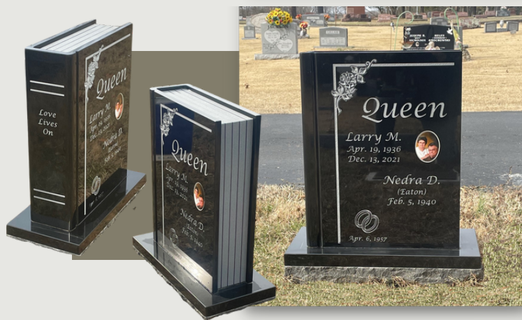
Book of Life Jet Black Leadwood City