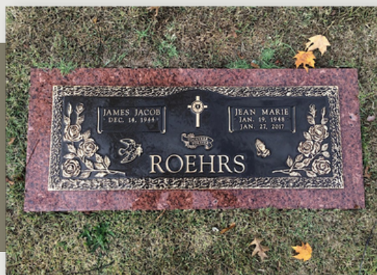
Bronze Marker Missouri Red Granite Backer Rose Lawn