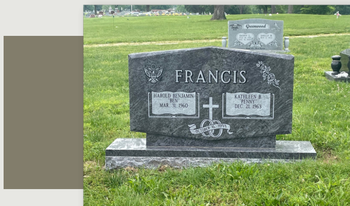
Chamfered Upright Bahama Blue Rose Lawn