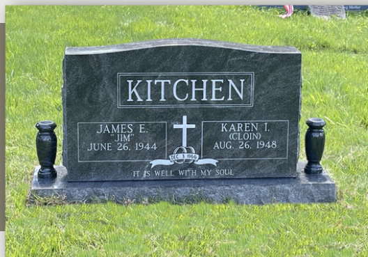
Upright American Black Arcadia Valley