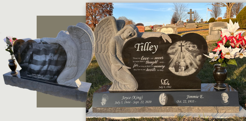
Double Heart with Angel Laser Etching Jet Black Shepherd Hills