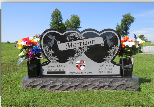
Double Heart Jet Black Rose Lawn