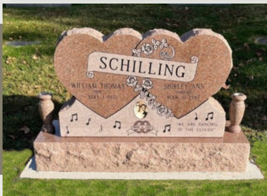
Double Heart Mountain Rose Shepherd Hills