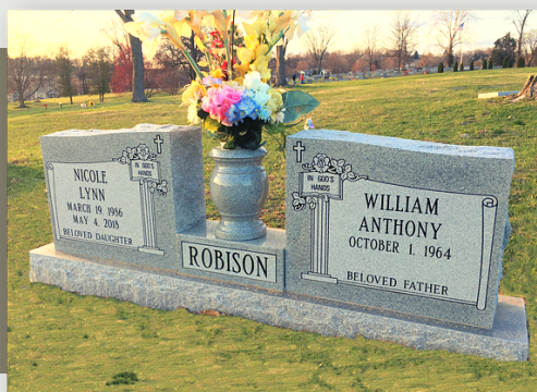
Plinth Grey Rose Lawn