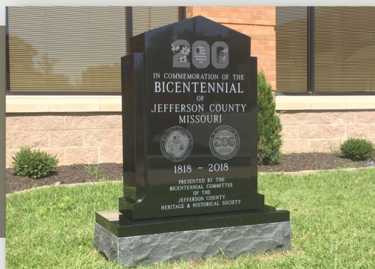
Commemorative Monument Roof Top Jet Black Jefferson County Admin Bldg