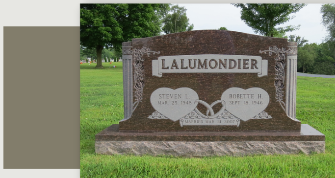
Upright Fluted Columns Cat's Eye Rose Lawn