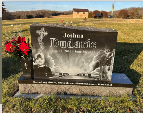
Half Serpentine Upright Laser Etching Jet Black Shepherd Hills