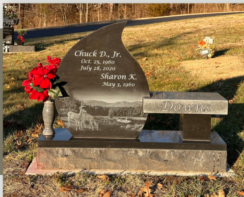
Teardrop with Bench Laser Etching Jet Black/Grey Shepherd Hills