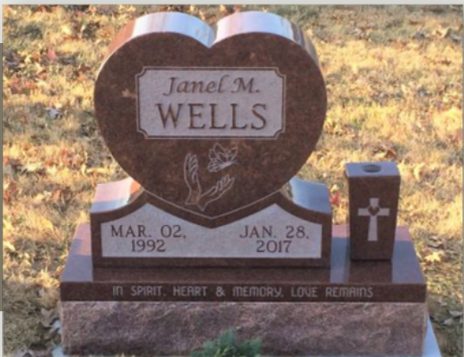
Single Heart India Red Immaculate Conception