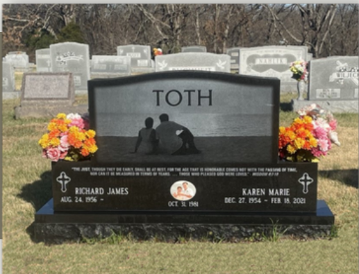
Upright Laser Etching Jet Black St. John's