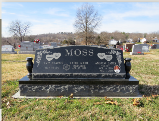
Slant Jet Black Sacred Heart

We provide stones for all cemeteries throughout East-Central Missouri.