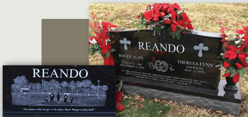
Upright Custom Hand Etching Jet Black Rose Lawn