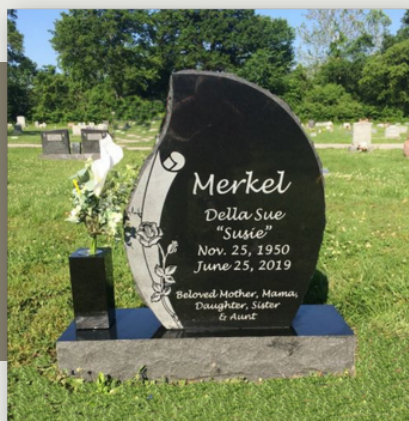
Teardrop Jet Black Herculaneum City

Enjoy peace of mind knowing that you selected the right monument.