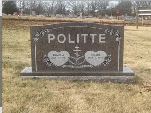
Upright Dakota Mahogany St. Mary's Orthodox