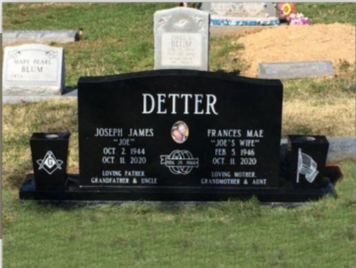
Upright Jet Black Woodlawn

We can help you create the perfect monument to fit your budget.